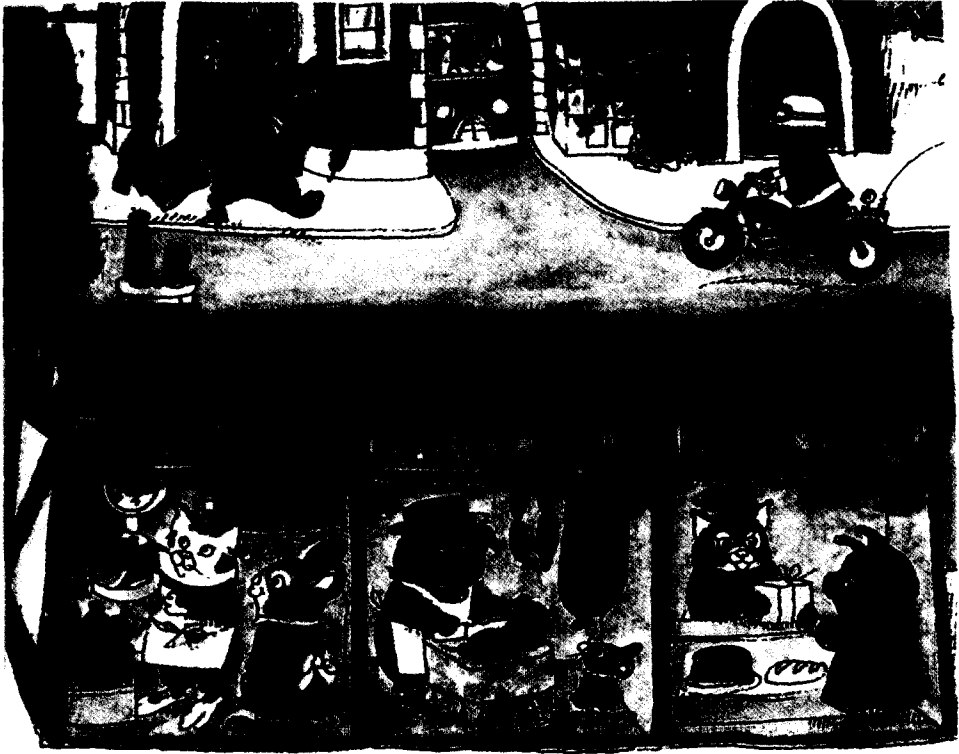
Fig. 6. The body fits the job II: A Busytown butcher.

(From What do people do all day? by Richard Scarry, copyright 1968, 1979. Used by the kind permission of Random House.)