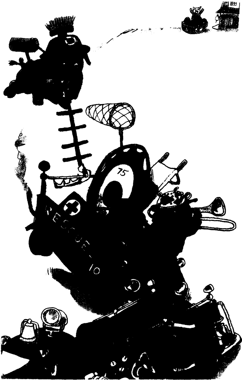
Fig. 3. Pig firemen.

(From What do people do all day? by Richard Scarry, copyright 1968, 1979. Used by the kind permission of Random House.)