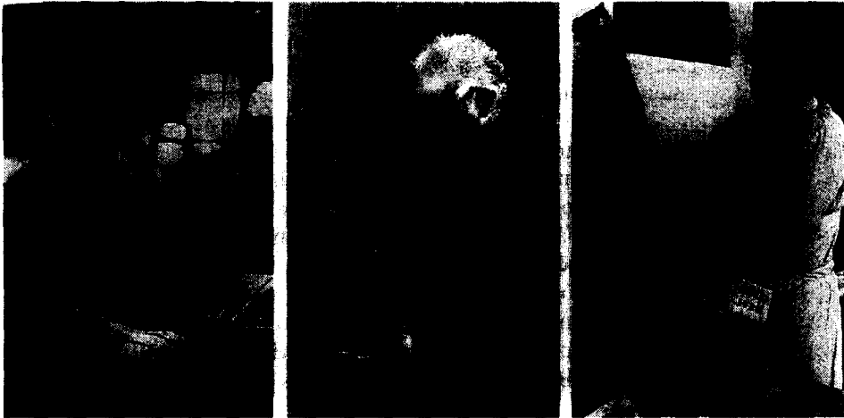
Fig. 1. The body for the job.

(Butcher picture from Pierre Bourdieu, Distinction , used by permission of Les Editions Minuit.)