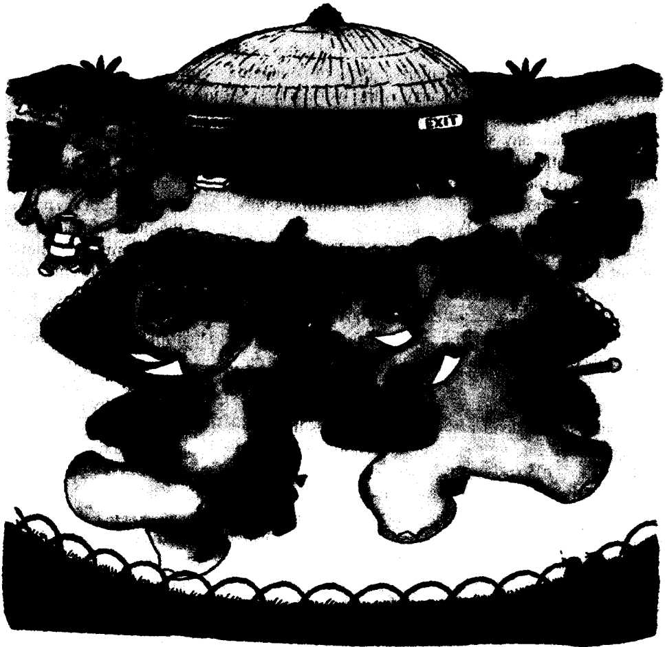
Fig. 5. From state of nature to civil society in Celesteville. (From Babar the king , by Jean DeBrunhoff, copyright 1935, 1963.) Used by the kind permission of Random House.)

And make no mistake, this differentiation is of paramount interest to DeBrunhoff. He has a long (and rather dull) description of how the division of labor works (“If Barbacol [the tailor] wants a statue for his mantelpiece, he asks Podular [the sculptor] to carve one for him, and when Podular’s coat is worn out Barbacol makes a new one”, DeBrunhoff, 1963 [1935]: 24), even down to reciprocity between the army officer who guards them from enemies, and the street cleaner who sweeps up